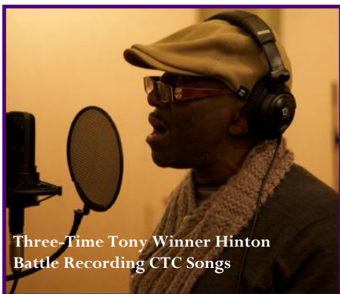
Three-Time Tony Winner Hinton Battle Recording CTC Songs